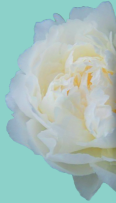
Bowl of Cream