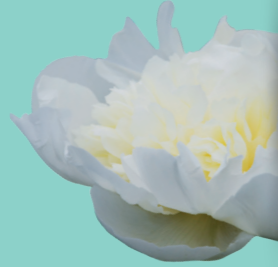
Duchesse de Nemours